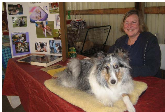
Meet the Breeds table, Muncie, IN August 18, 2012