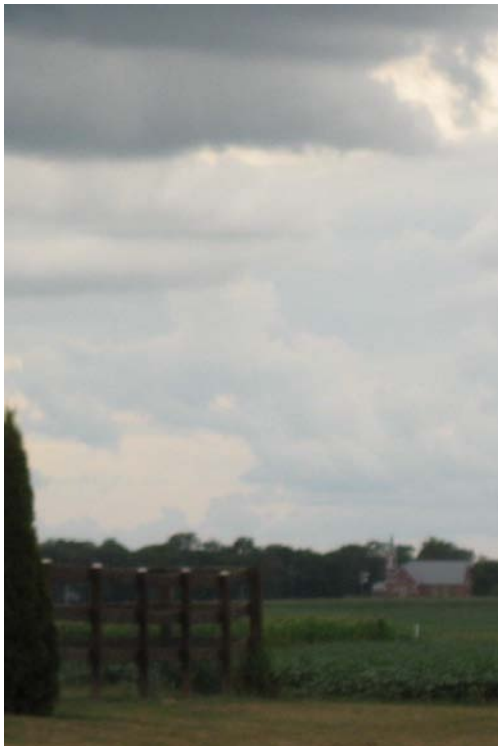
Dan & Gregg's Home Place - Beautiful!!