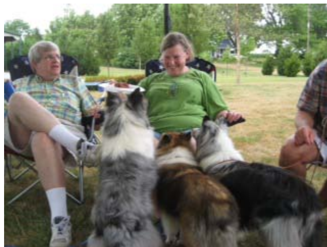
CISSC Summer Picnic, July 14, 2012