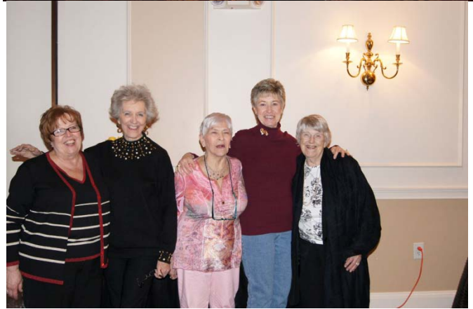
Lifetime Members and Friends