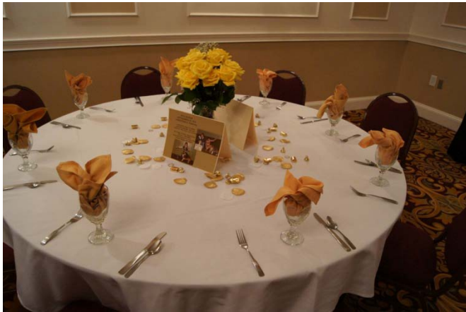
Tables were beautifully decorated