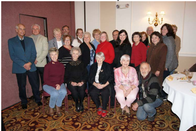
All attending the banquet had a very enjoyable time