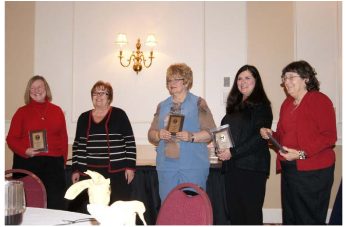
President's Award Recipients